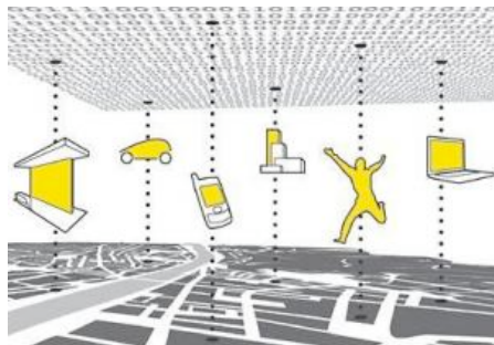
In the 'Wiki City Rome' project an MIT team will obtain data anonymously from cell phones and other devices to map Rome in real time.

The project will debut Sept. 8 during Rome's "Notte Bianca" or white night, an all-night festival of events across the capital city. During that night, anyone with an Internet connection will be able to see a unique map of the Italian capital that shows the movements of crowds, event locations, the whereabouts of well-known Roman personalities, and the real-time position of city buses and trains.